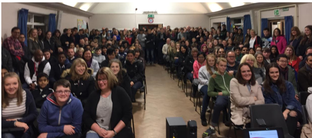
Year 2 Launch Night – November 2016