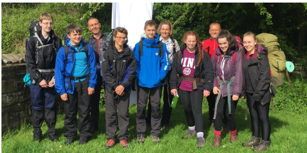
Volunteer leaders at a Silver practice expedition