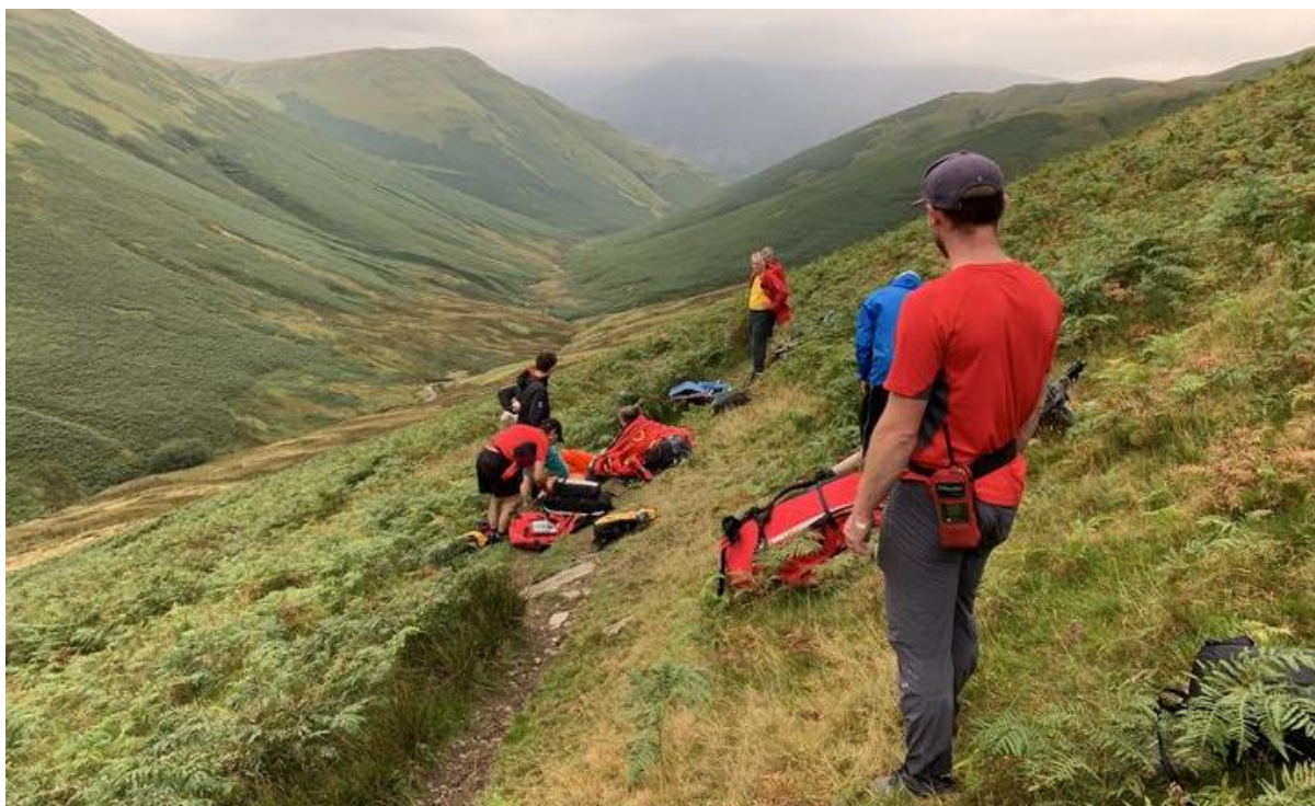
Keswick Mountain Rescue Team attending one of our Gold expedition teams

15 members successfully completed their Qualifying expedition, and we are hopeful that a substantial number of these will complete the full Award.