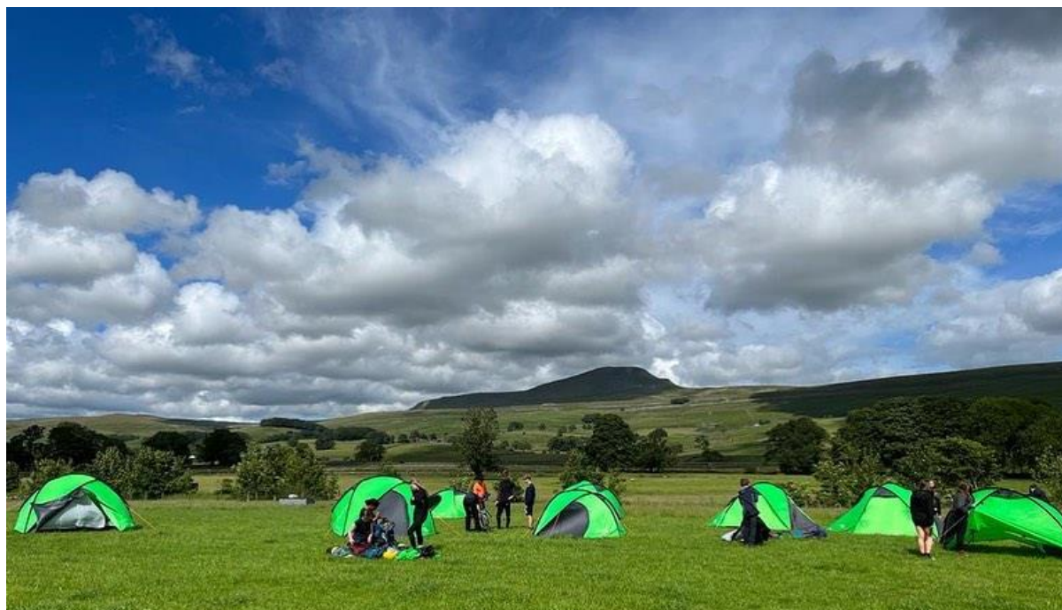
Silver campsite in Yorkshire